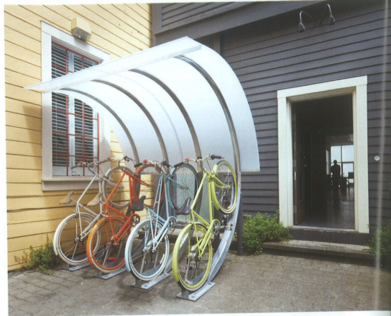
▲▼ Bike Arc Half Arc

In addition to the individual Rac Arc and the 60-bike-capacity Tube Arc, Bellomo has adapted the form for use in small-scale housing, advertising, and even car parking—electric only, of course.—HALLIE BORDEN